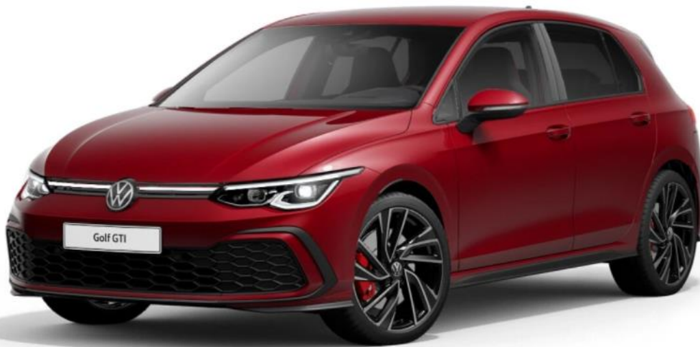
GTI DSG shown with optional 'Adelaide' alloys